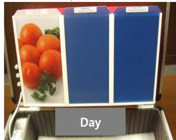
Channel Signage Applications